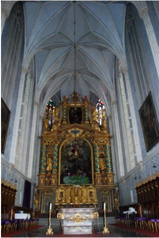
Benedictine Abbey of Göttweig